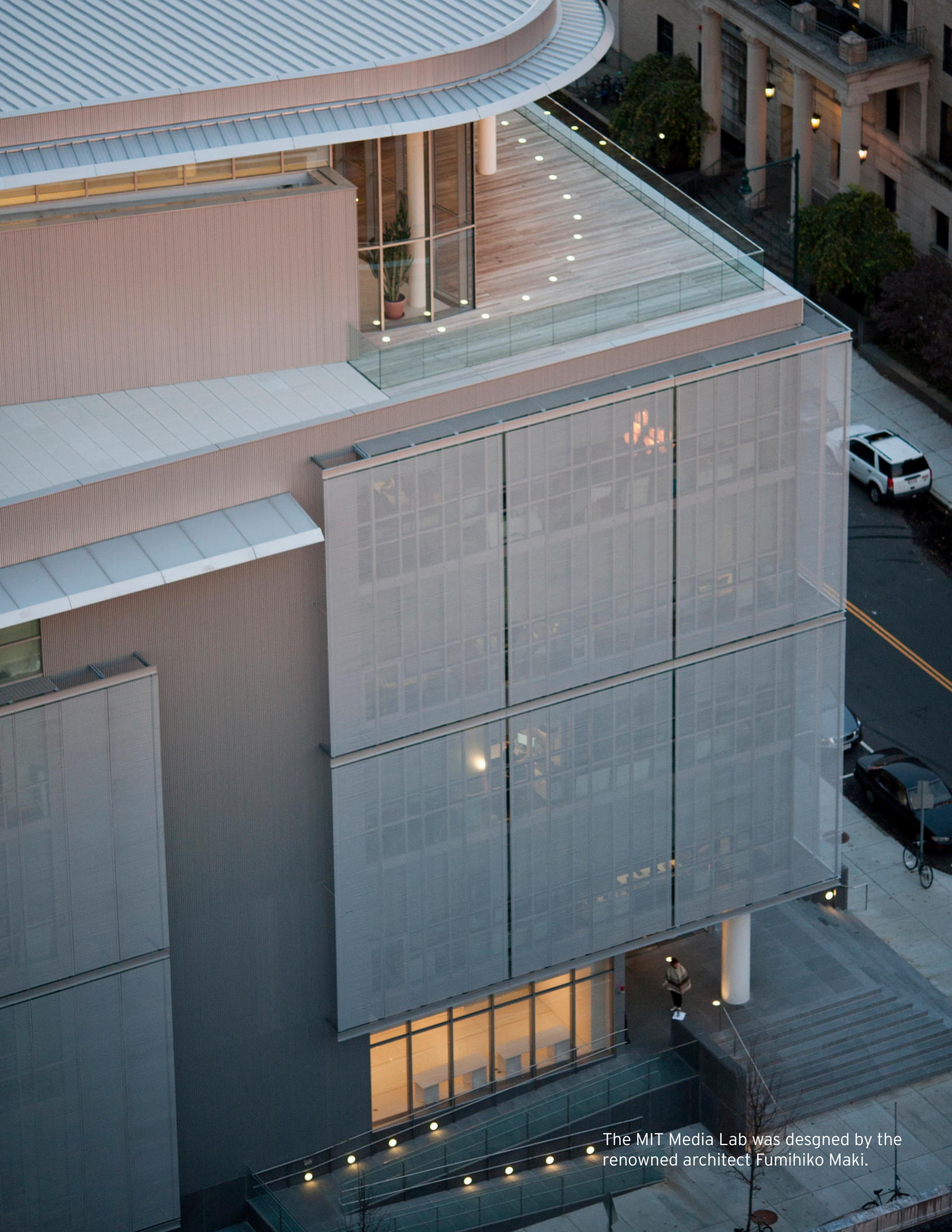
The MIT Media Lab was designed by the renowned architect Fumihiko Maki.